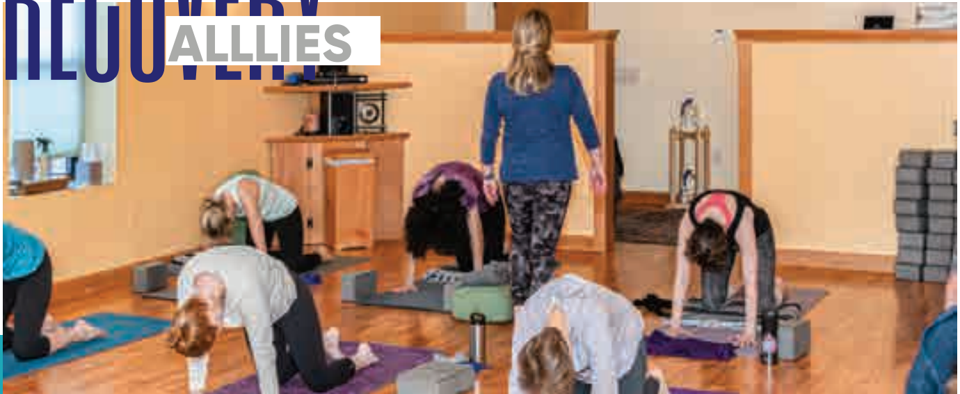
A morning class at Yogave, a donation-based yoga studio in Falmouth.